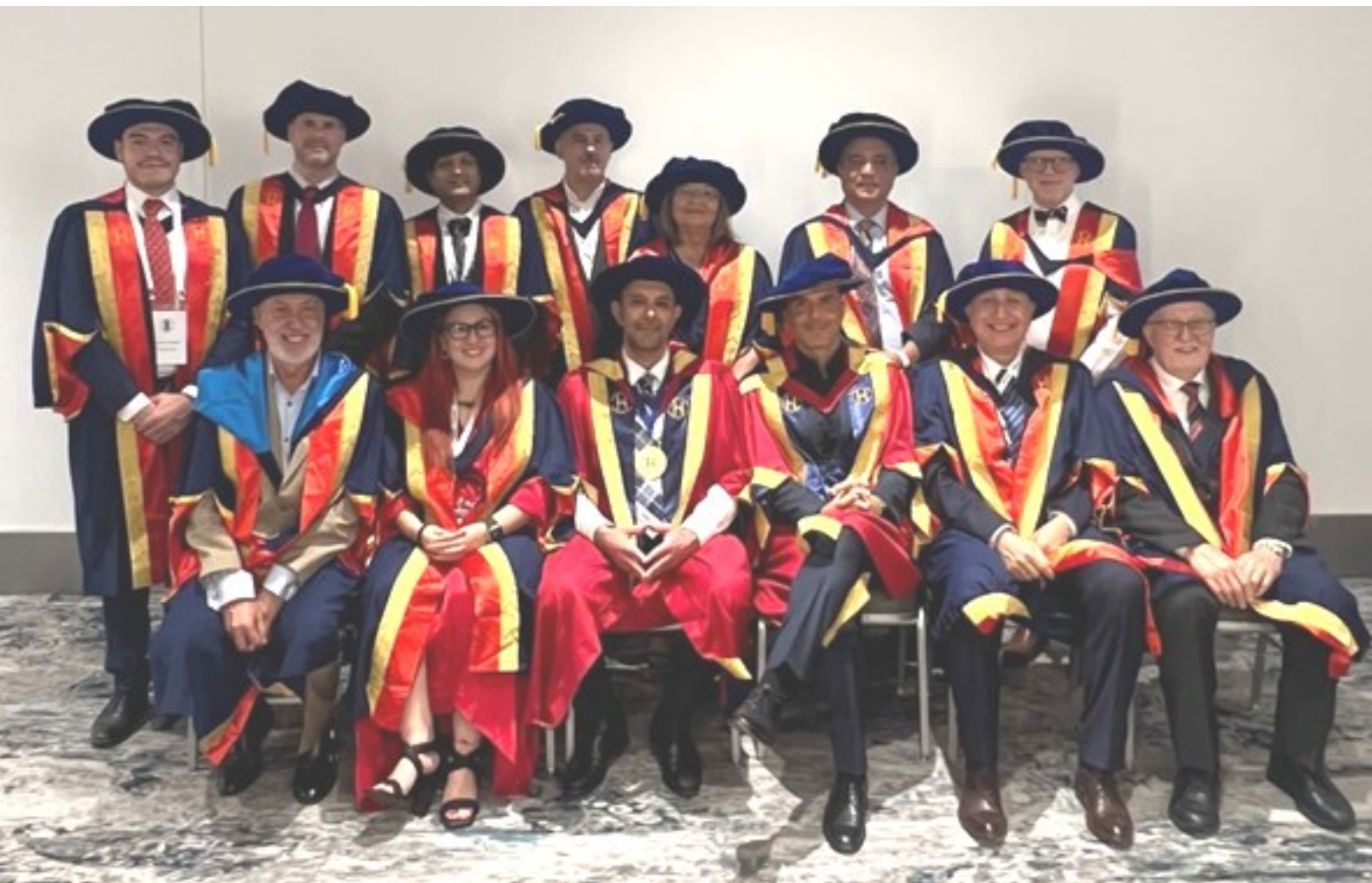
UIP Executive Committee 2022-2025

Whatever need, do not hesitate to reach out to me ( gnsstrg@unife.it ; t. +393498012304)