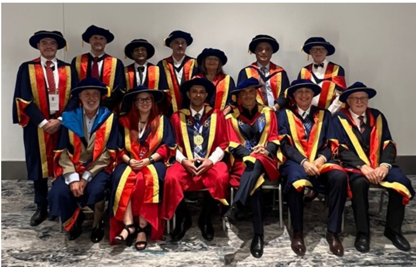
UIP Executive Committee 2022-2025

Whatever need, do not hesitate to reach out to me ( gnsrsg@unife.it ; t. +393498012304)