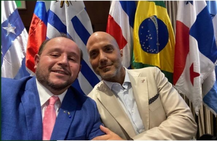
Memories from the latest SOPFYL Congress, Flebopanam 2022, Guayaquil, Ecuador