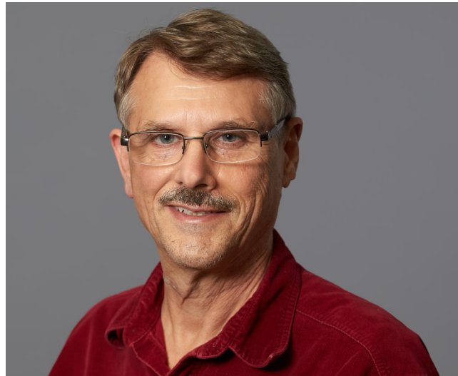
Prof. Gordon Guyatt

Initially, when I started as Internal Medicine Residency Director at McMaster, the goal was to teach residents to independently evaluate original articles. It became evident that this was not realistic and the EBM focus became on providing clinicians with pre-processed evidence in the form of systematic reviews and, increasingly, trustworthy practice guidelines. A major focus of EBM over the last 20 years has therefore been establishing scientific standards for what makes guidelines trustworthy.